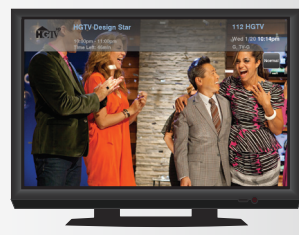
The TV channel changes.