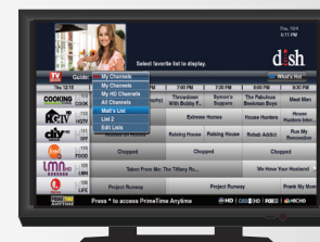
The Favorites List drop down menu appears.