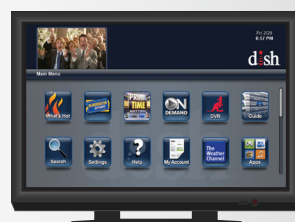
The TV is on a menu screen.