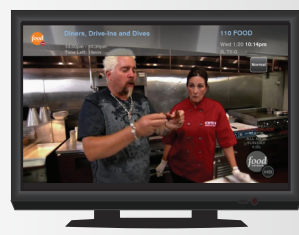
The TV changes to the highlighted channel.