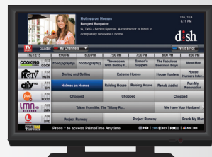
The Program Guide moves up or down.