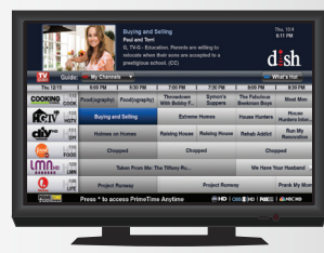
The Program Guide appears.